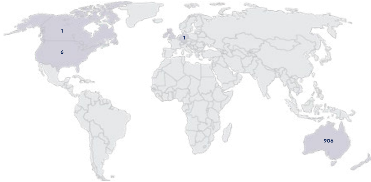
Figure 1 2024-25 VicTrack Active Third-Party Suppliers by Country of Origin. (Source: Internal Finance Data)

This reporting year, the number of Tier One suppliers reduced from 1088 to 921. Suppliers provided additional information regarding their own supply chains as part of our 2024–5 review process. All suppliers with active status in our finance system were reviewed.